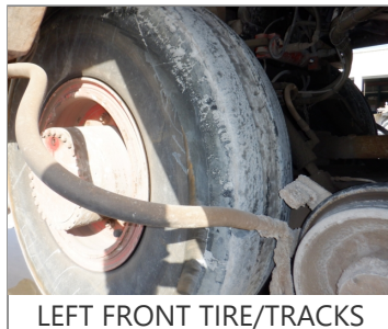
LEFT FRONT TIRE/TRACKS