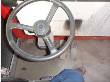
LEFT SIDE CONTROLS