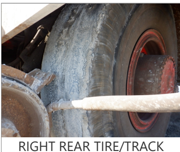
RIGHT REAR TIRE/TRACK