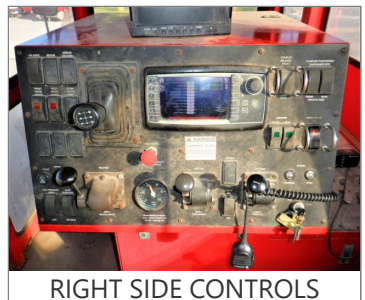
RIGHT SIDE CONTROLS