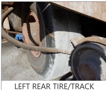
LEFT REAR TIRE/TRACK