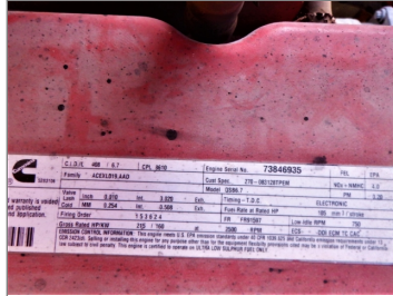
ENGINE DATA PLATE