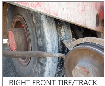
RIGHT FRONT TIRE/TRACK