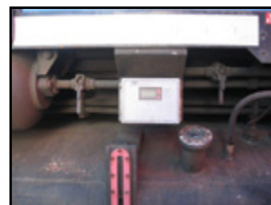
(Click Images to Enlarge)