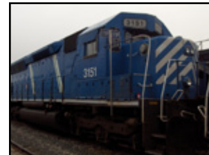
(Click Images to Enlarge)