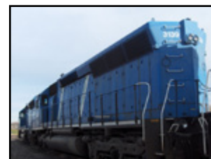
(Click Images to Enlarge)